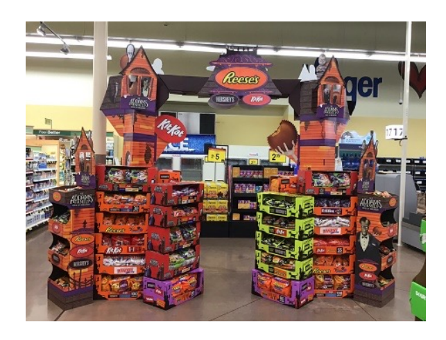
DESIGN OF THE TIMES GOLD AWARD Best Sales Driving Solution