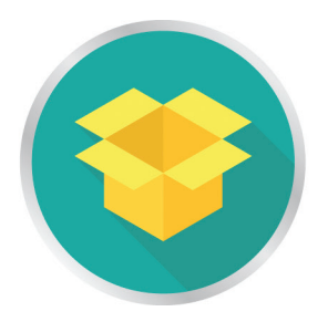
FULFILLMENT Scale, capacity & capability