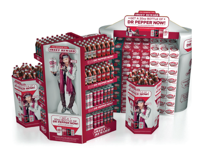
DESIGN OF THE TIMES PLATINUM AWARD Best Brand-building Program