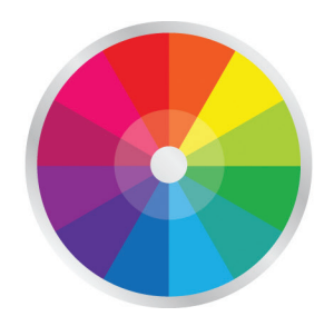
PRINT Full spectrum print solutions & connective packaging